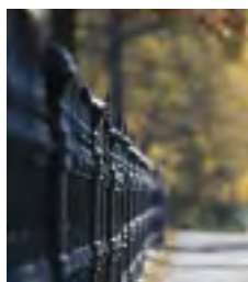
MHC Welcomes 21st-Century Scholars