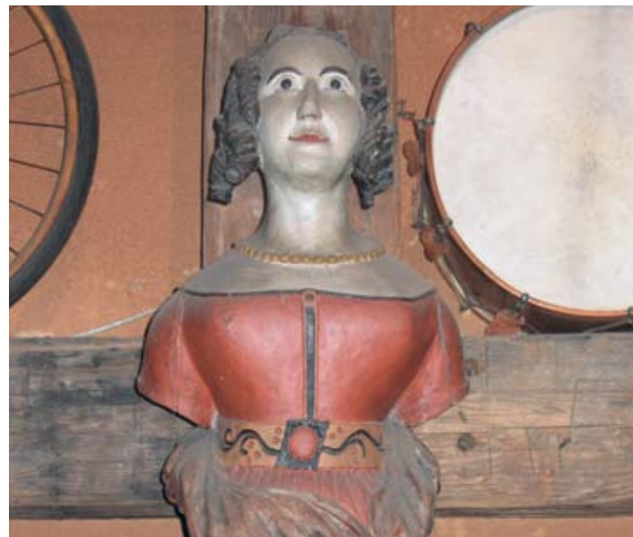
Part of the collection of “Mr. Skinner’s Curiosity Cabinet” — also known as Mount Holyoke’s Skinner Museum. A booklet created by UMass graduate students recommends ways the collection can be put to use.