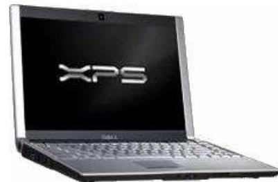
(2008) Dell XPS M1330 (2.6 GHz Core2Duo, 4GB memory)