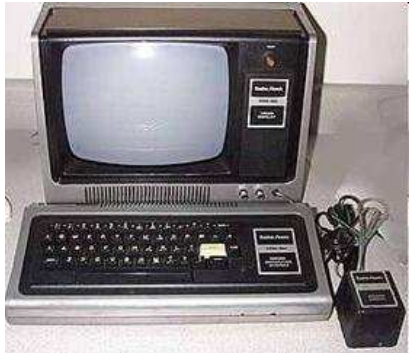
(1979) Radio Shack TRS-80 (1.77MHz Z80, 4kB memory)