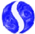
Silent Spring Institute