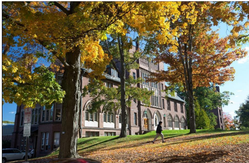
Mount Holyoke College